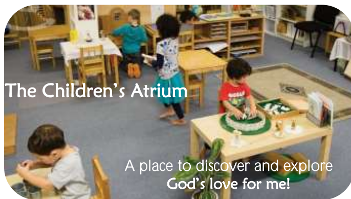
The Children's Atrium

A place to discover and explore God's love for me!